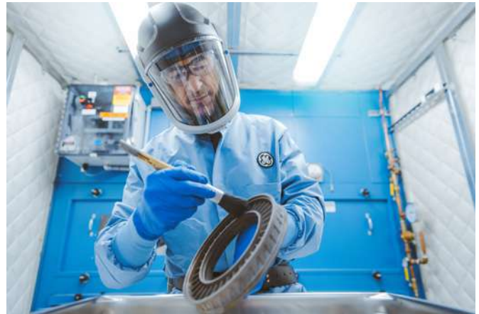
GE Research is where scientific research meets reality to propel GE and the world forward

GE uses SingleStore and designed AI processes around it to do transactional reconciliation across its ecosystem. Significant portions of the process are automated, freeing up business users for other vital duties. Real-time data access across the global organization improved productivity and decreased costs. Instead of 200 auditors spanning the globe, five auditors can now do the work in a single location.