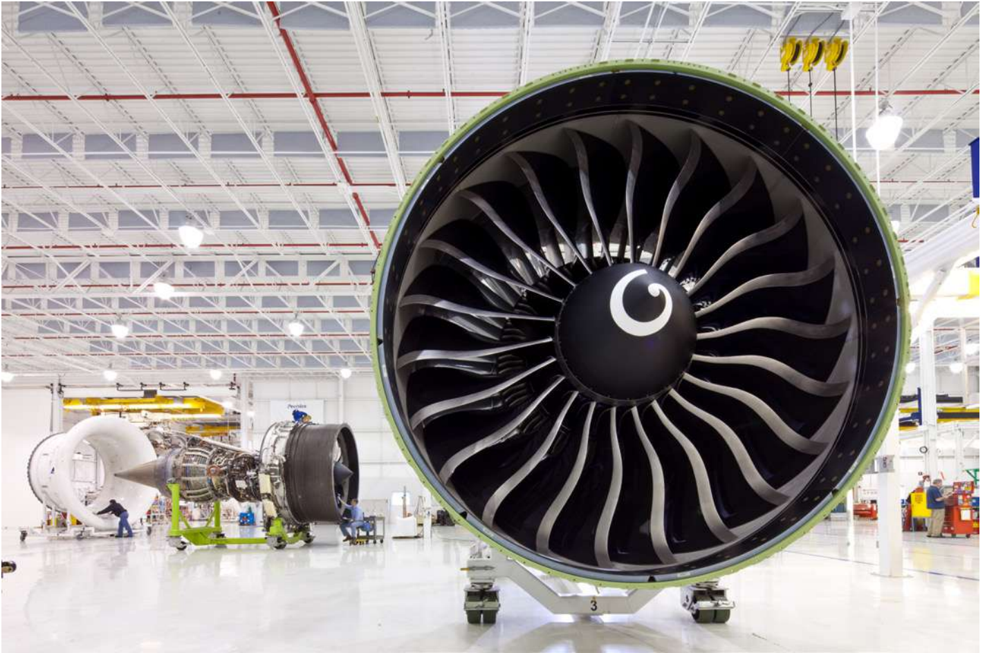
GE Aviation is a world-leading provider of aircraft engines, systems, and avionics