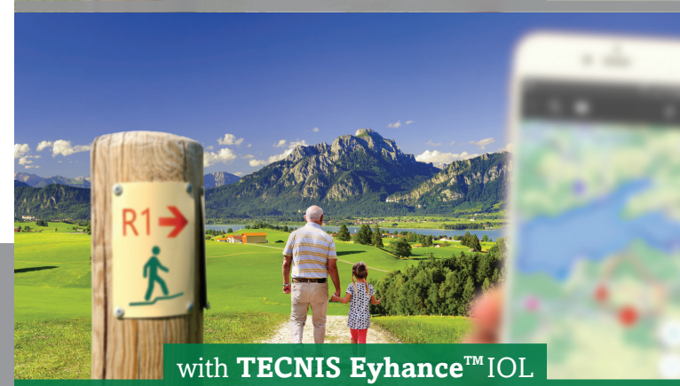
with TECNIS Eyhance™ IOL

These images are for illustrative purposes only and do not represent actual data derived from studies. These illustrative simulations are intended to help you better understand your vision in certain eye conditions.