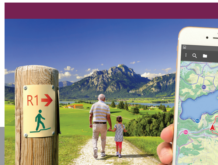
With TECNIS Synergy™ OptiBlue™ IOL

These images are for illustrative purposes only and do not represent actual data derived from studies. These illustrative simulations are intended to help you better understand your vision in certain eye conditions.