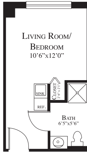
STUDIO II 248 SQ FT