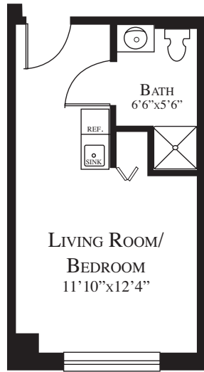
STUDIO I 270 SQ FT