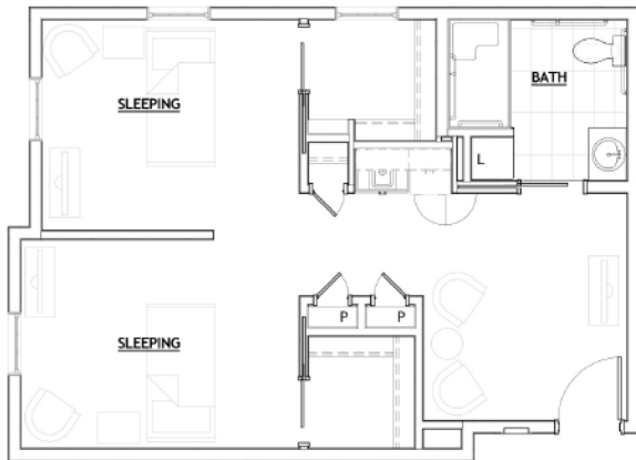
COMPANION SEMI-PRIVATE - 558 SQ FT