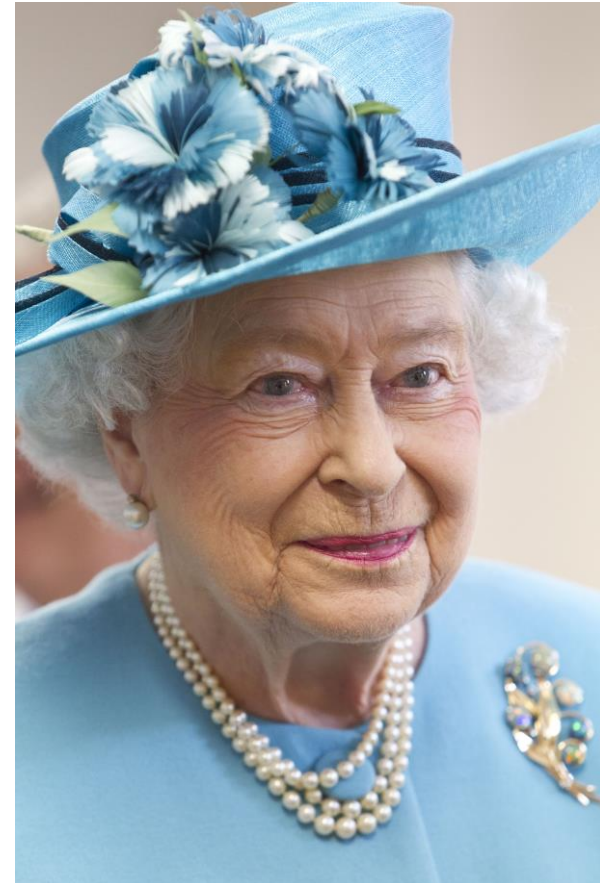
CHADWELL HEATH, ENGLAND - JULY 16: Queen Elizabeth II during a visit to Chadwell Heath Community Centre on July 16 in Chadwell Heath, United Kingdom.

England plays host to the Rugby World Cup. 20 nations will compete for the Webb Ellis Cup, with New Zealand the strong favourites.