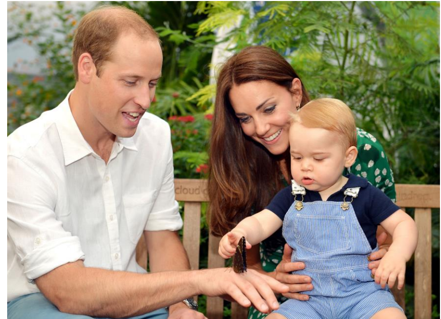
Catherine, Duchess of Cambridge holds Prince George as he points to a butterfly on Prince William, Duke of Cambridge's hand as they visit the Sensational Butterflies exhibition at the Natural History Museum on July 2, 2014 in London, England. The family released the photo ahead of the first birthday of Prince George on July 22.

The seventh Summit of the Americas – which takes place in Panama – may be the setting for an historic meeting between President Barack Obama and President Raul Castro of Cuba.