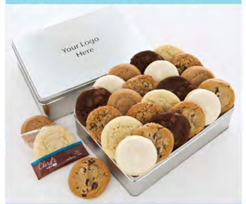
Available in 1-color 24052 Silver $39.99