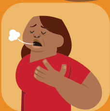
Short of breath