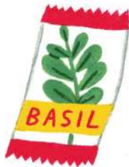
HERBS IN PLASTIC