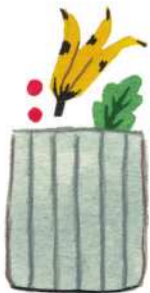
THROWING AWAY FOOD WASTE