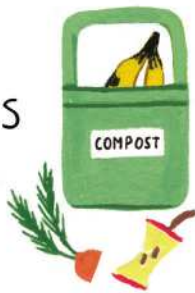
COMPOSTING FOOD WASTE