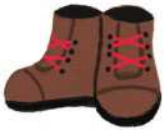
WALKING TO THE PARK