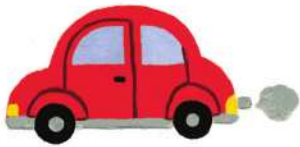
DRIVING TO THE PARK