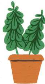
GROW YOUR OWN HERBS