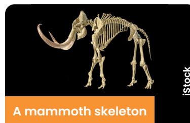
A mammoth skeleton

Colossal plans to produce lab-based embryos that carry mammoth DNA from frozen specimens of the ancient animals, which died out around 4,000 years ago. These embryos would then be carried by a surrogate (substitute) elephant mum, or possibly in an artificial womb, until birth.