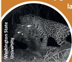
Washington State University

The footage, taken from a camera trap in Guatemala, shows a male jaguar waiting at a waterhole to ambush its prey. He ignores a large tapir that passes, but soon after attacks and carries off an ocelot. The footage was shot during a particularly dry spell and scientists are looking into whether there is a link between predator-on-predator attacks and a shortage in water supplies. The full research has been published in the journal Biotropica .