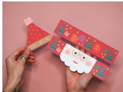
STEP 2 / CUT AROUND THE ILLUSTRATIONS