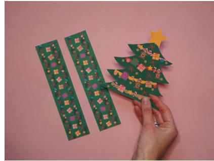
STEP 2 / CUT AROUND THE ILLUSTRATIONS