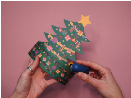
STEP 4 / STAPLE THE CHRISTMAS TREE