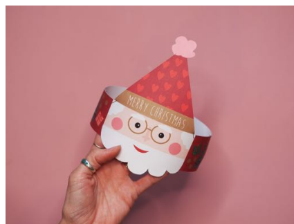
STEP 5 / YOU CAN NOW PROUDLY WEAR YOUR CHRISTMAS CROWN