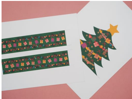
STEP 1 / PRINT THE DESIGNS WITH YOUR HP PRINTER