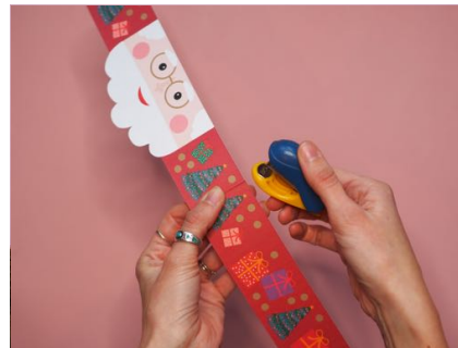
STEP 3 / STAPPLE BOTH SIDE OF THE CROWN