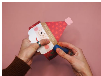
STEP 4 / STAPLE THE HAT