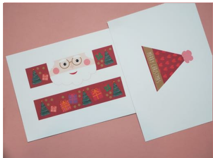
STEP 1 / PRINT THE DESIGNS WITH YOUR HP PRINTER