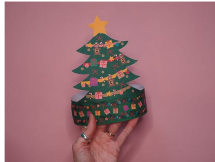
STEP 5 / YOU CAN NOW PROUDLY WEAR YOUR CHRISTMAS TREE CROWN