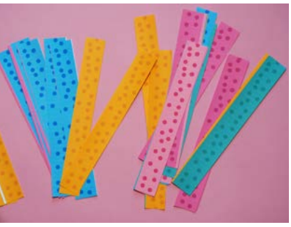
STEP 2 / Cut around the illustrations