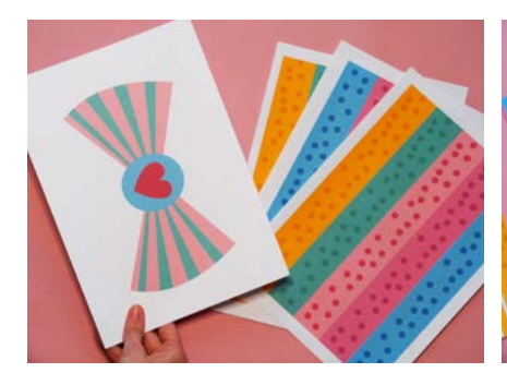
STEP 1 / Print the designs with your Hp printer