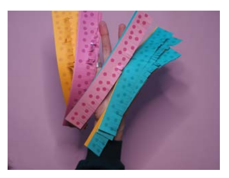
STEP 4 / Cut fringes on the paper stripes (remember to keep an untouched band wide enough to put glue on )