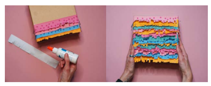
STEP 4 / Start gluing the paper stripes on one side of the box strating from the bottom