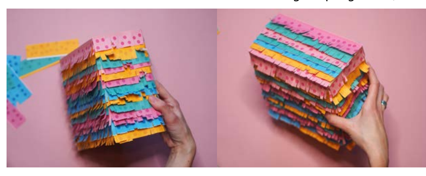
STEP 5 / Now you will have to do the same on every side of the box