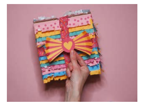
STEP 7 / Add the bow. The piñata is ready!