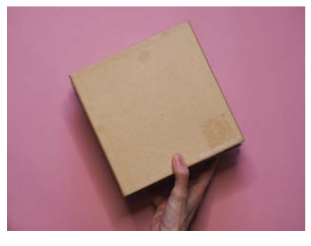
STEP 3 / You will need a cardboard box (any shape will do)