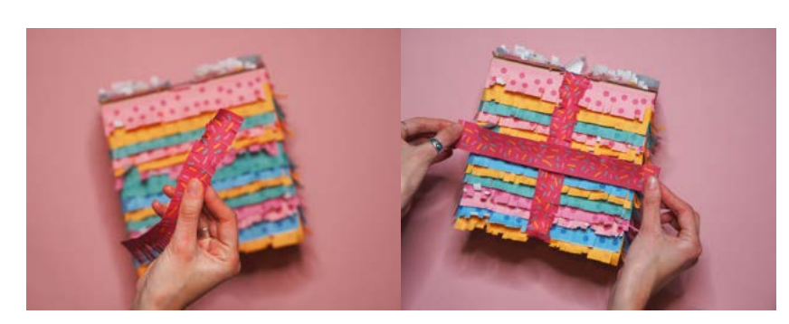
STEP 6 / cut fringes along both sides of the big red stipes and put them on the gift like a ribbon