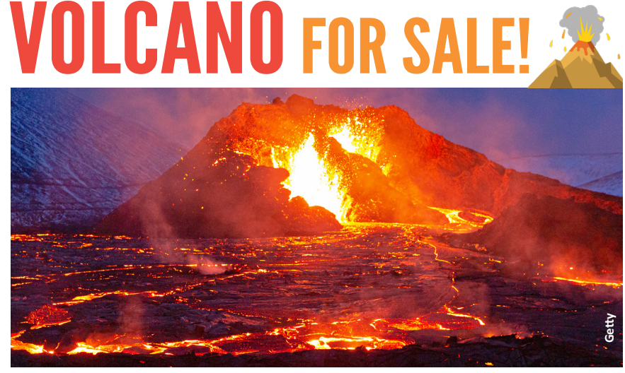
AN area of land that includes an erupting volcano is up for sale in Iceland.

A BOTTLE of wine that spent 14 months in space could fetch $1m after going up for sale. It even comes with a corkscrew made from a meteorite!