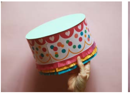
STEP 8 / Repeat step 7 for each different level of the cake