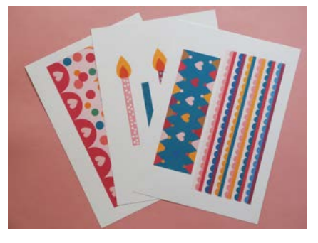
STEP 1 / Print the designs with your Hp printer