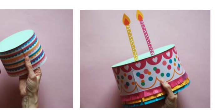
STEP 9/ Now you can add the candles and glue the levels on top of each other. Your birthday cake is ready. Happy Birthday!