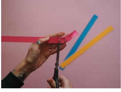
STEP 5 / cut fringes on the colored paper stripes (remember to keep an untouched band wide enough to put glue on)