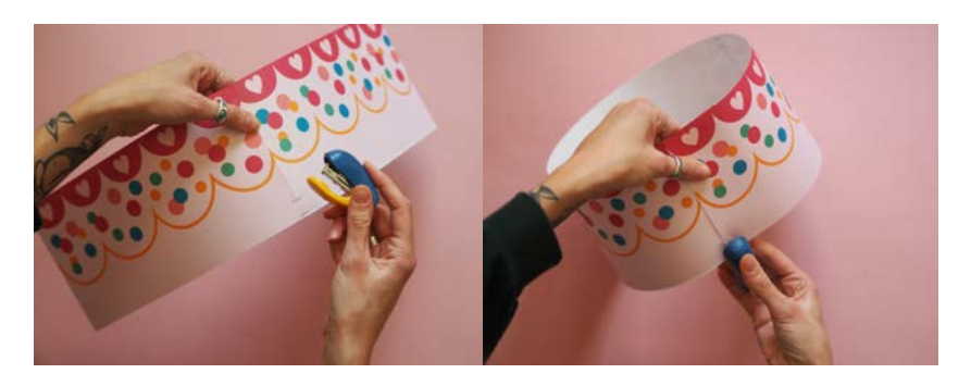
STEP 3 / Staple the matching bands together to create a ring