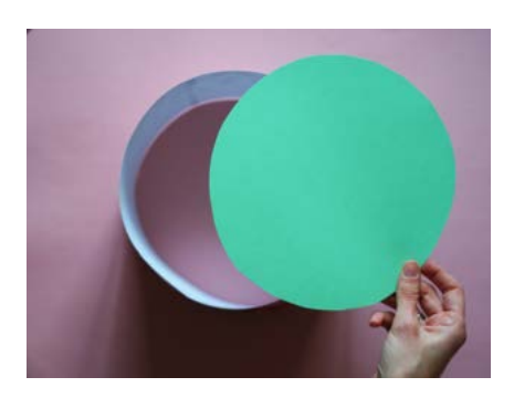
STEP 7 / We now need to cut paper circles to put them on the top of each cake. Use the cakes as references to trace the circles on colored paper sheet before cutting them out. You may also use cardboard or plain white paper sheets.