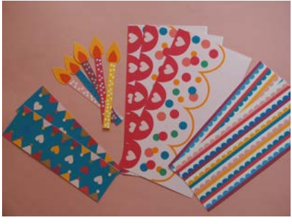
STEP 2 / Cut around the illustrations