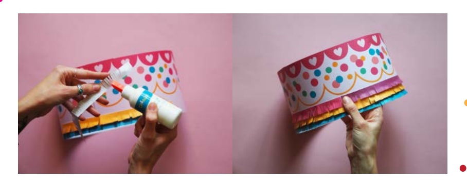
STEP 6 / Glue your bands around the bottom of the birthday cake. You can mix the colors if you want.