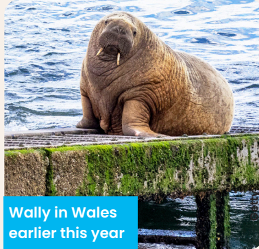
Wally in Wales earlier this year

Experts are hoping Wally is getting some good rest and eating lots before continuing his journey back to the Arctic.