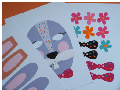
STEP 1 / PRINT THE DESIGN WITH YOUR HP PRINTER