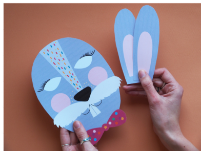
STEP 2 / CUT AROUND THE ILLUSTRATION