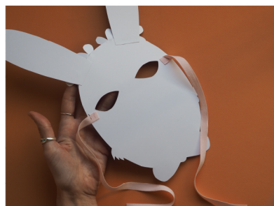
STEP 8 / STAPPLE SECOND RIBBON ON THE RIGHT SIDE OF THE MASK