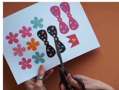
STEP 4 / CUT AROUND THE SMALL ILLUSTRATIONS