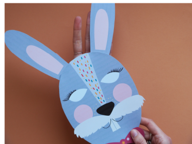
STEP 3 / GLUE THE EARS