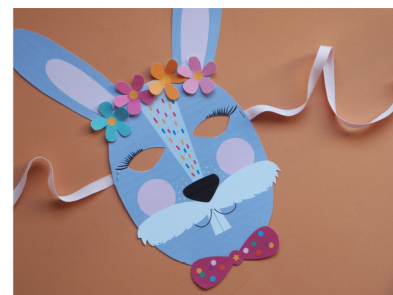
STEP 9 / YOUR PAPER BUNNY FACE MASK IS READY!