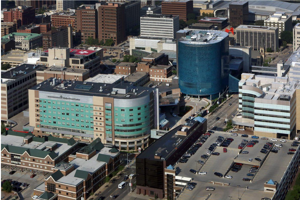
Medical Center – Aerial View