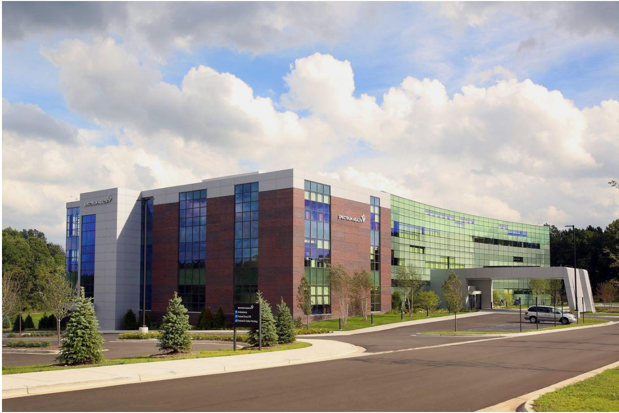
Integrated Care Campus – Beltline location