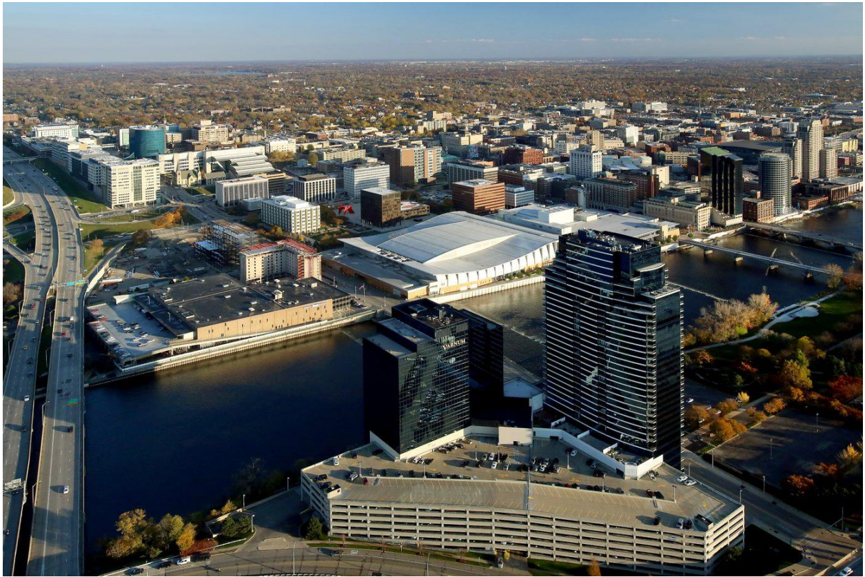
Grand Rapids, Michigan