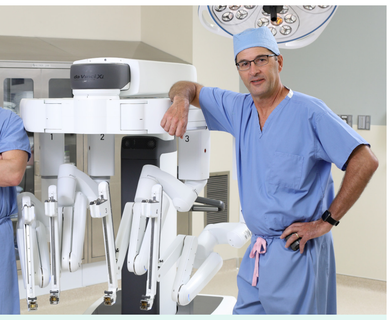
am benefits our patients by offering minimally invasive surgical technology

The new addition is designed with today's patients in mind and will ultimately provide better and more efficient care to patients with greater convenience, more privacy and added safety measures. Benefits of this space align with and support the Spectrum Health mission of improving health, inspiring hope and saving lives. Construction is on track with anticipated completion by the end of 2021.