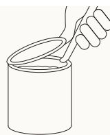
Step 2: Open