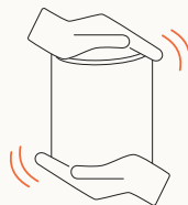
Step 1: Shake gently

This product has not been registered by the US EPA.