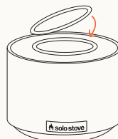
Step 5: Extinguish