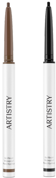
自然啡 Natural Brown