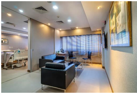
Thomson Premier Suite