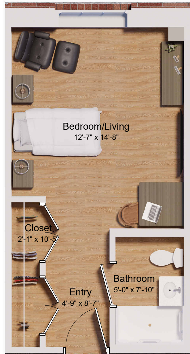
① 113 - Level 1 Unit Floor Plan 1/4" = 1'-0"