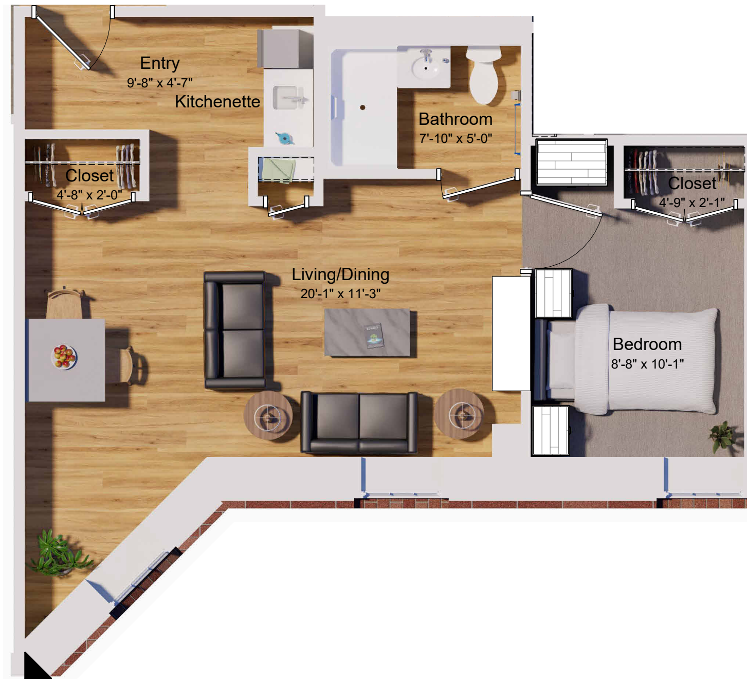
① 231 - Briscoe Level 2 Unit Floor Plan 1/4" = 1'-0"