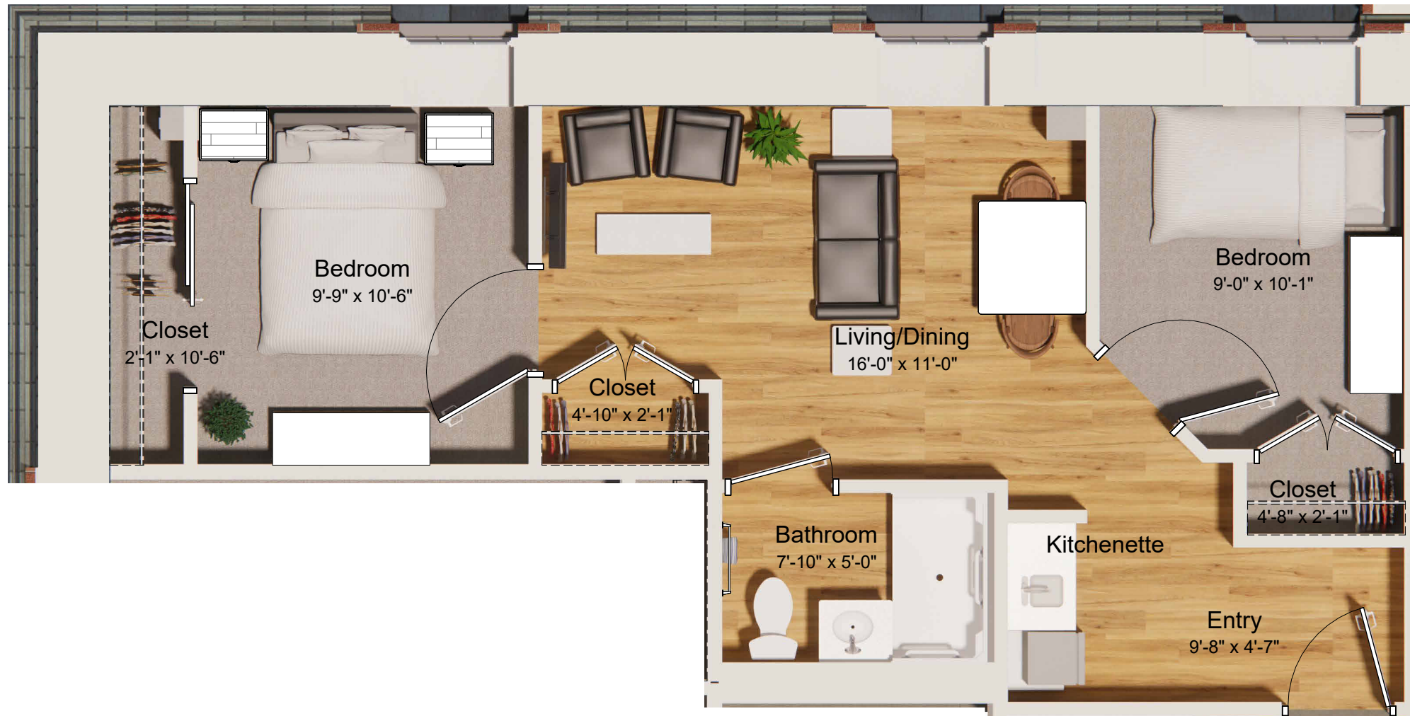
① 327 - Briscoe Level 3 Unit Floor Plan 1/4" = 1'-0"