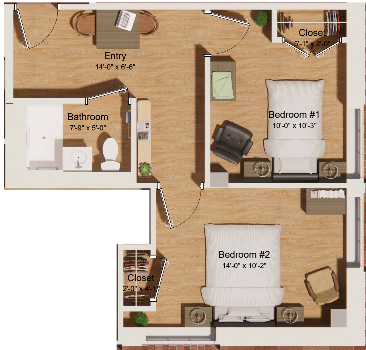
① 116 - Level 1 Unit Floor Plan 1/4" = 1'-0"