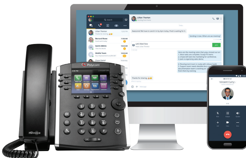
8x8 Virtual Office