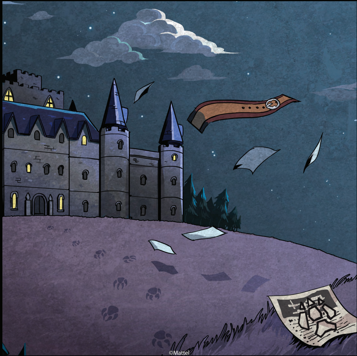
P2 Puzzle - Back