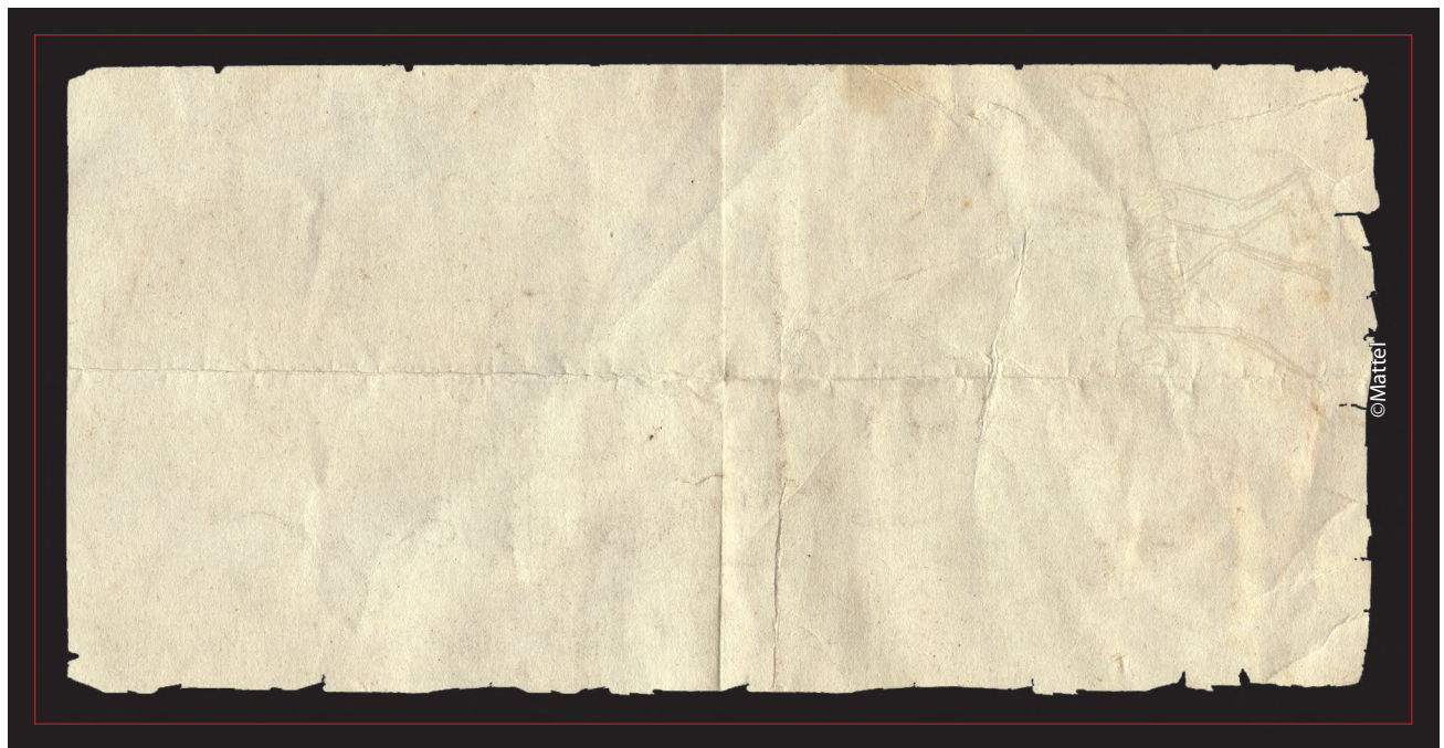
Bonus Puzzle - Back