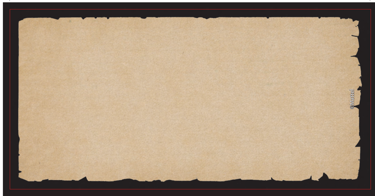
Note From Doc Gnaw - Back