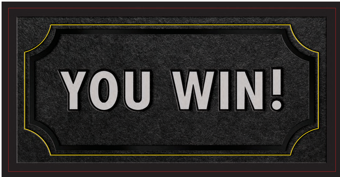
"You Win" Note - Back