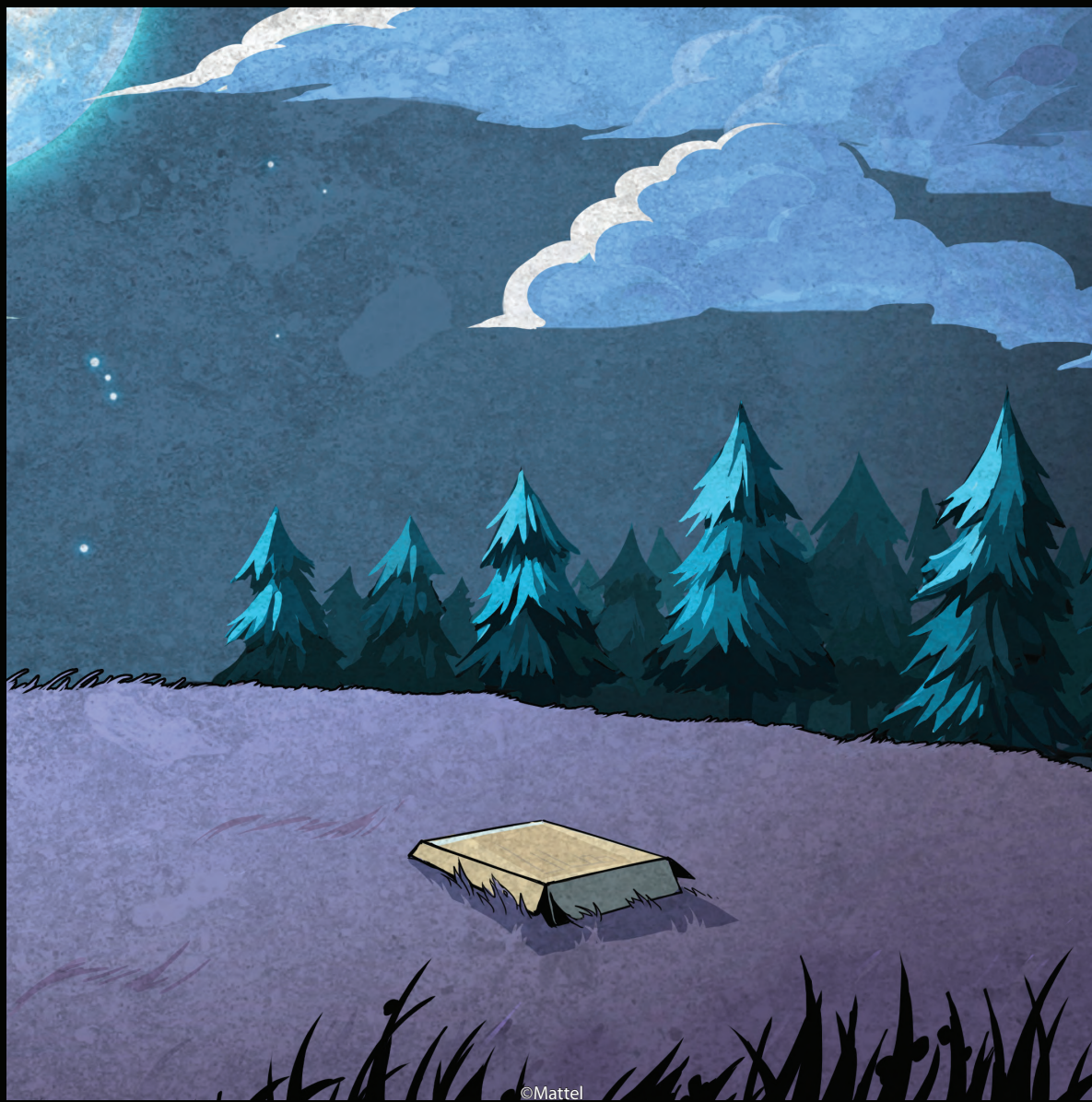
P4 Puzzle - Back