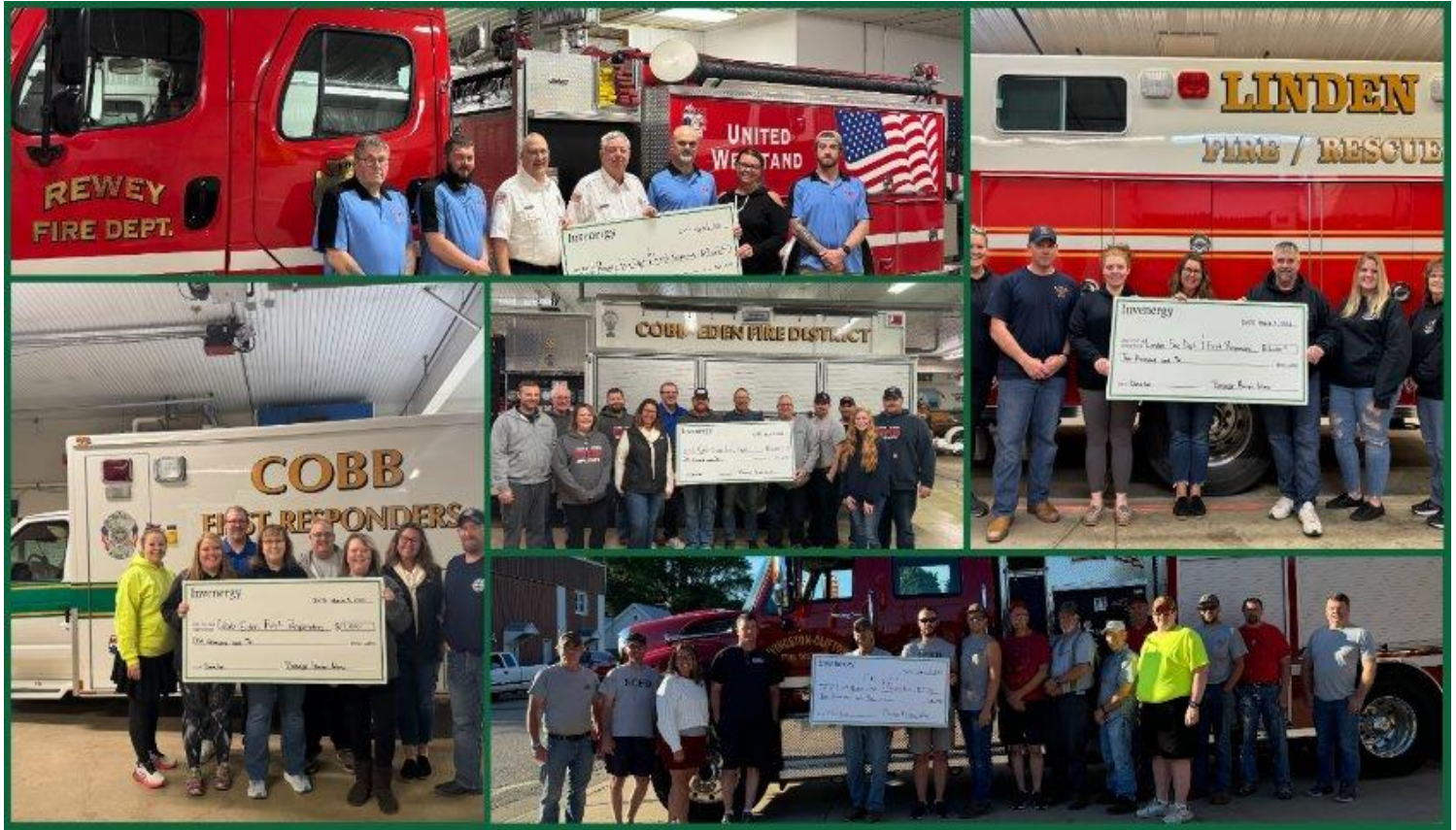
Above: The Badger Hollow Wind team donated $10,000 to the Cobb, Eden, Livingston-Clifton, Linden, Montfort, and Rewey Fire and Rescue Services.

Badger Hollow Wind will invest up to $550,000 annually through local tax revenue, supporting the local economy through increased funding for causes like local infrastructure, fire and emergency services, and schools. In addition, Invenergy is a long-term partner committed to giving back to Iowa and Grant County residents.