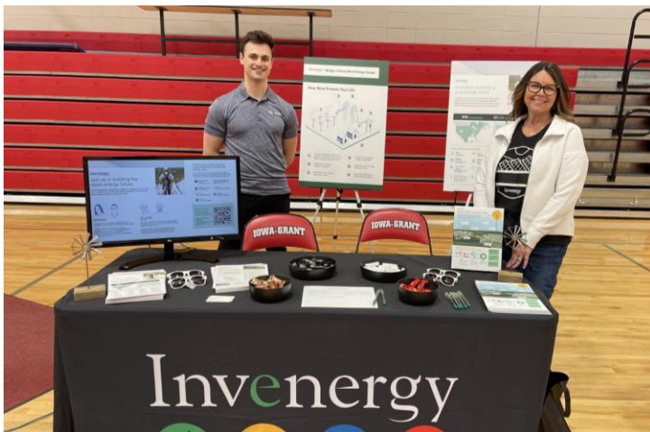
Above: The Badger Hollow Wind team always enjoys attending the Iowa Grant High School career fair and speaking with students about careers in the American energy industry.