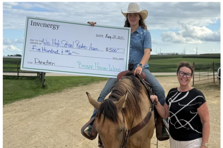
Above: The Badger Hollow Wind team has donated to Wisconsin High School Rodeo Association for three years in a row. The funds help with entry fees, team jackets and travel costs to rodeos around the state.