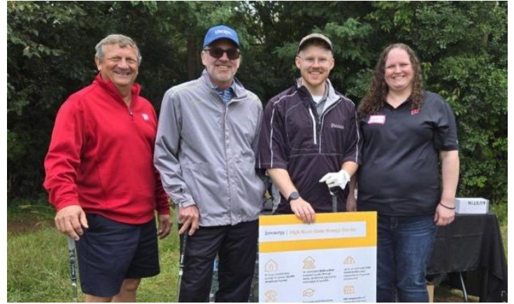
Above: The High Noon Solar team was a proud hole sponsor for the Poynette Area Chamber of Commerce Golf Outing in Poynette, Wisconsin! Not only was it a great day of fun and networking, but it also supported an amazing cause, the Chamber's Scholarship Fund, which helps local students achieve their educational dreams.