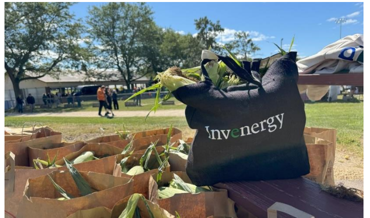
Above: Invenergy and the Darien Solar team were thrilled to help plan and sponsor the 63rd Darien Corn fest in Darien, Wisconsin. We love supporting gatherings like this that make our communities such great places to live and grow!