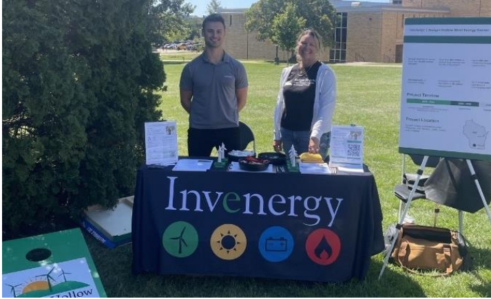
Above: The Badger Hollow Wind team hosted an information table (and project themed corn hole) at the University of Wisconsin-Platteville Campus Welcome Day! The team had a great time meeting and chatting with the future leaders of Wisconsin's clean energy economy.