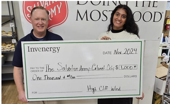
Above: Invenergy's High Cliff Wind team presented a donation to the Salvation Army of Calumet County's Red Kettle Campaign. The donation will help support programs and services that assist families in need in Calumet and southern Manitowoc counties.