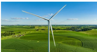
Invenergy-operated Red Barn Wind Park located in Grant County, Wisconsin.

6 Invenergy operated sites totaling more than 720 megawatts where we provide management and O&M, with 1 project developed by a third-party