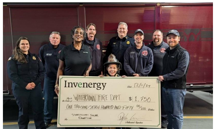
Above: The Sinnissippi Solar team made donations to the Ixonia, Johnson Creek, and Watertown fire departments to assist crews in maintaining department resources and making equipment updates.