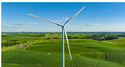
Invenergy-operated Red Barn Wind Park located in Grant County, Wisconsin.

8 Invenergy operated sites totaling more than 1,080 megawatts where we provide management and O&M, with 1 project developed by a third-party