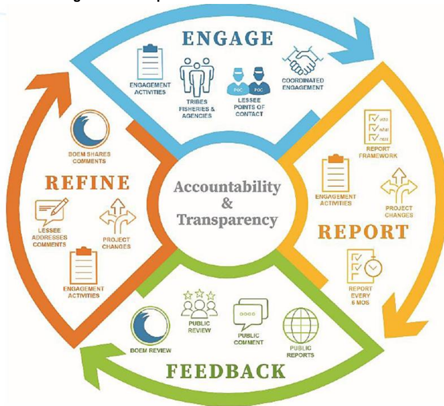
Figure 2. Principles for Successful Communication