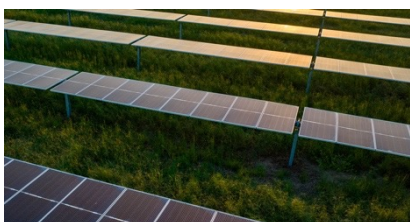
Invenergy's 100 th project, Southern Oak Solar Energy Center, located in Mitchell County, Georgia.

8 Invenergy operated sites totaling 1,550 megawatts where we provide management and O&M, with 8 projects owned by a third party