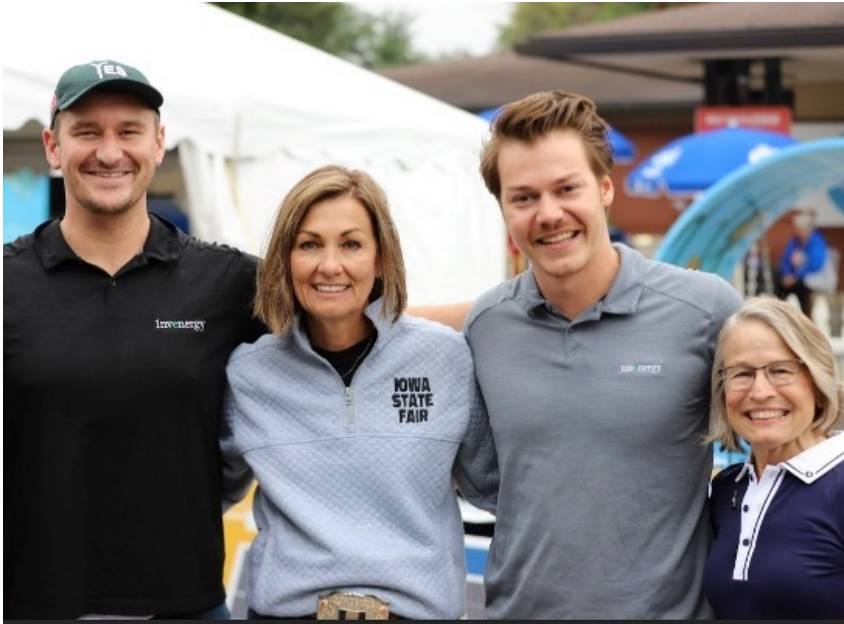
Above: The Iowa development team was proud to participate in Power Up Iowa Day at the Iowa State Fair! The team had a fantastic time connecting with community members and showing our commitment to powering Iowa's future. We were also honored to meet Iowa Governor Kim Reynolds and Iowa State Representative Mariannette Miller-Meeks.