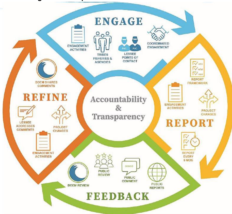
Figure 2. Principles for Successful Communication