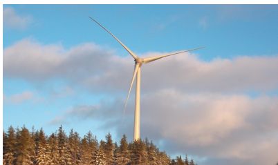
Invenergy's Le Plateau Wind Energy Centre located in the Gaspé region, Quebec.

Actively pursuing development in 8 provinces