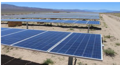
Invenergy developed project, Luning Solar Energy Center, located in Luning, Nevada

Commits to developing projects while minimizing impacts to sensitive ecological resources and ensuring responsible land use