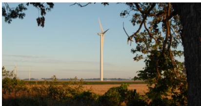
Invenergy’s Forward Wind Energy Center, located in Dodge and Fond du Lac Counties, Wisconsin.

Commits to developing projects while minimizing impacts to sensitive ecological resources and ensuring responsible land use