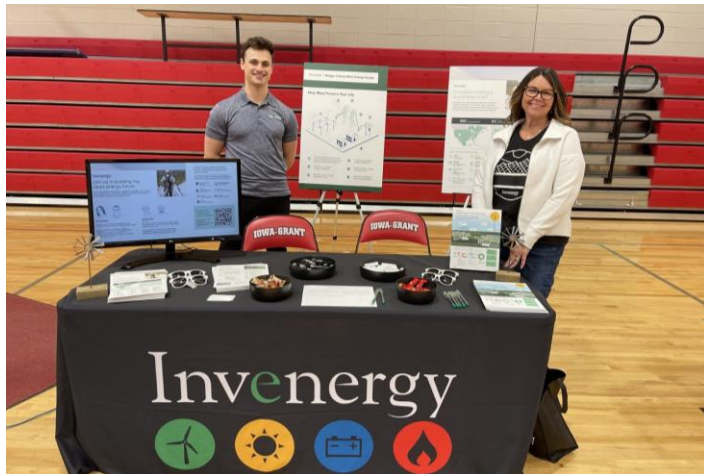
Above: The Badger Hollow Wind team volunteered at the Iowa Grant High School career fair - chatting with students and handing out information about the project.