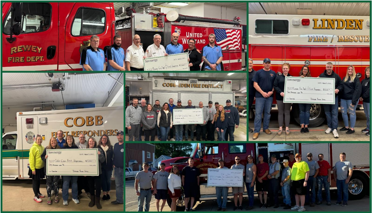
Above: The Badger Hollow Wind team donated $10,000 to the Cobb, Eden, Livingston-Clifton, Linden, Montfort, and Rewey Fire and Rescue Services.

Badger Hollow Wind will invest $590,000 annually through local tax revenue, supporting the local economy through increased funding for Fire and EMS, local infrastructure projects, and community organizations, giving back to Iowa and Grant County residents.