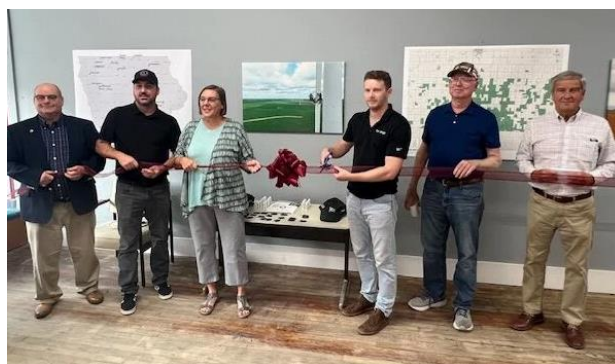
Shenandoah Hills Wind Office 515 W. Sheriden Ave, Shenandoah, IA 51601