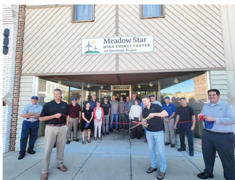
Meadow Star Wind Office 111 E Main St, Cherokee, IA 51012