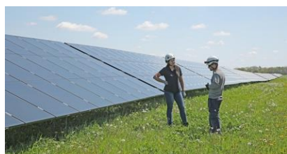
Invenergy's Grand Ridge Energy Center located in LaSalle County, Illinois.