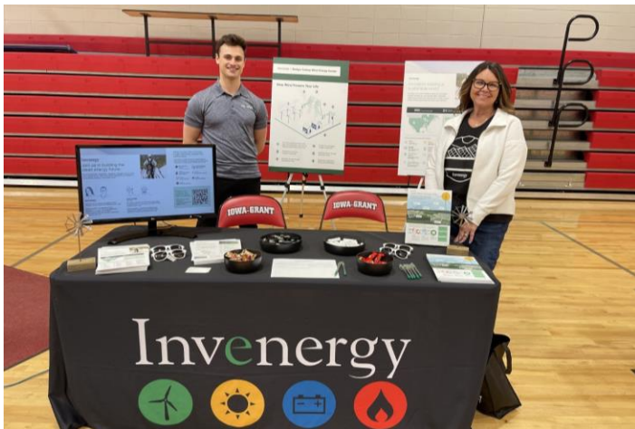
Above: The Badger Hollow Wind team volunteered at the Iowa Grant High School career fair - chatting with students and handing out information about the project.