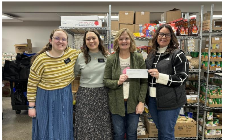
Above: The Badger Hollow Wind team meets with volunteers and presents a donation to the Second Harvest Foodbank.