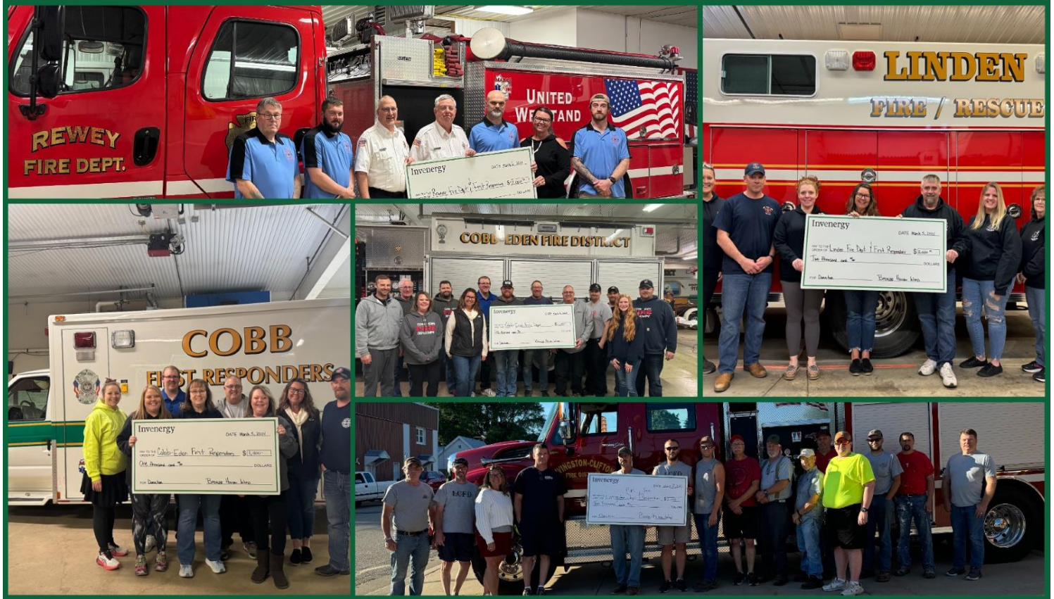
Above: The Badger Hollow Wind team donated $10,000 to the Cobb, Eden, Livingston-Clifton, Linden, Montfort, and Rewey Fire and Rescue Services.

Badger Hollow Wind will invest up to $590,000 annually through local tax revenue, supporting the local economy through increased funding for Fire and EMS, local infrastructure projects, and community organizations, giving back to Iowa and Grant County residents.