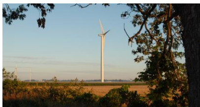
Invenergy's Forward Wind Energy Center, located in Dodge and Fond du Lac Counties, Wisconsin.