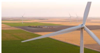
Invenergy's Spring Canyon Energy Center, located in Logan County, Colorado.

Committed to responsible, end-of-life recycling solutions for up to 90% of wind turbine components when possible