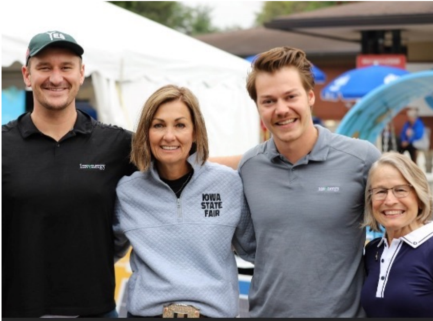
Above: The Iowa development team was proud to participate in Power Up Iowa Day at the Iowa State Fair this summer! The team had a fantastic time connecting with community members and showing our commitment to powering Iowa's future. We were also honored to meet Iowa Governor Kim Reynolds and Iowa State Representative Mariannette Miller-Meeks.