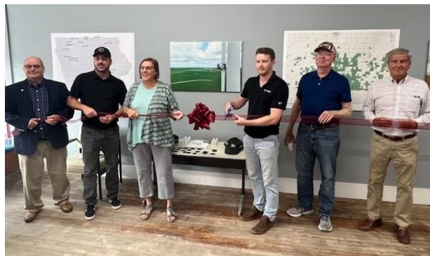
Shenandoah Hills Wind Office 515 W. Sheriden Ave, Shenandoah, IA 51601