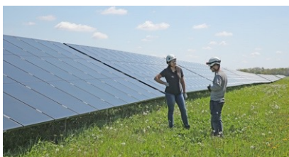
Invenergy's Grand Ridge Energy Center located in LaSalle County, Illinois.

8 Invenergy operated sites totaling 1,540 megawatts where we provide management and O&M, with 7 projects owned by a third party