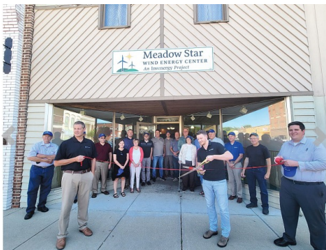
Meadow Star Wind Office 111 E Main St, Cherokee, IA 51012