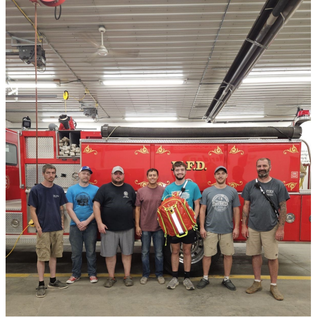
Above: Invenergy Plymouth Wind operations team helped support the Meriden Fire Department through the donation of a first aid bag (pictured) and continues to build on our strong partnership with local fire and EMS services throughout Plymouth County, IA.