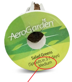
Each Seed Pod Label shows the number of days until seeds sprout.