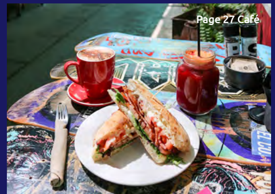
Page 27 Café

Once your feet are planted firmly again on the ground, it is time to indulge in a cooked breakfast at the Bean Tree Café which you can find nestled in the Olive Pink Botanic Garden . It is Australia's only arid zone botanic garden and the perfect place to relax for breakfast or lunch amongst the native surrounds. Take the time to wander along the walking trails to see the hundreds of plant species that are native to the Red Centre or spot some of the 80 bird species which have been recorded at the park.