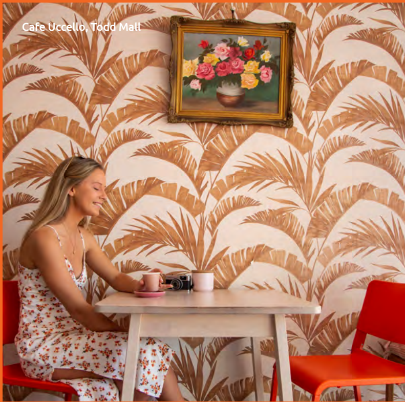
Cafe Uccello, Todd Mall