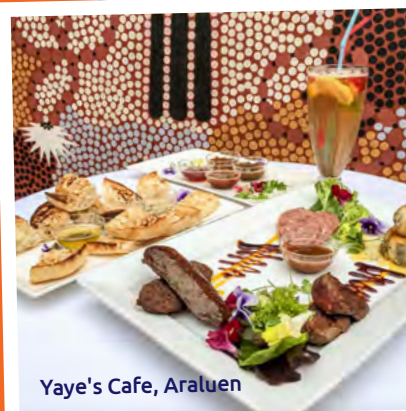
Yaye's Cafe, Araluen