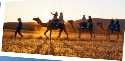
Earth Sanctuary World Nature Centre