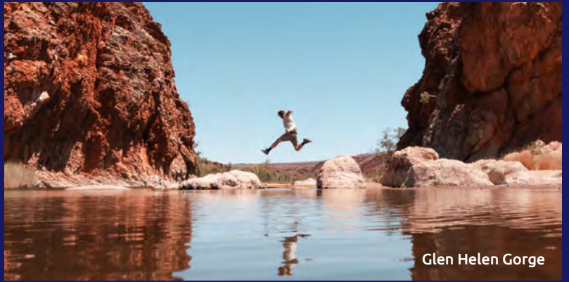
Glen Helen Gorge

Continue on along Larapinta Drive, turning right at Namatjira Drive. Approximately 80km along the Drive you will arrive at Glen Helen Homestead Lodge. The landscape around Glen Helen is truly spectacular with towering sandstone walls greeting you as you arrive. Enjoy your lunch teamed with a cold drink as you relax on the back verandah of the restored homestead overlooking the majestic Glen Helen Gorge .