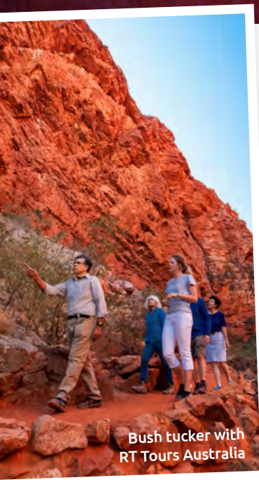
Bush tucker with RT Tours Australia