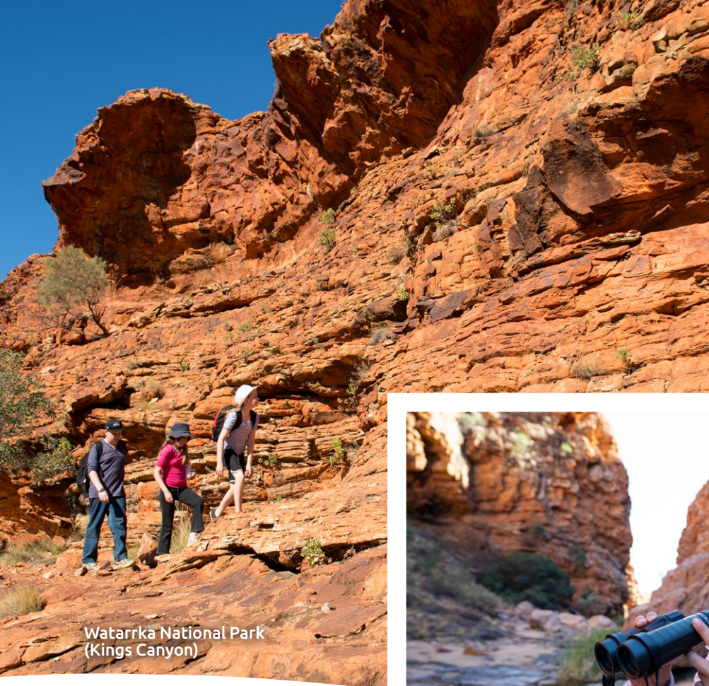
Watarrka National Park (Kings Canyon)