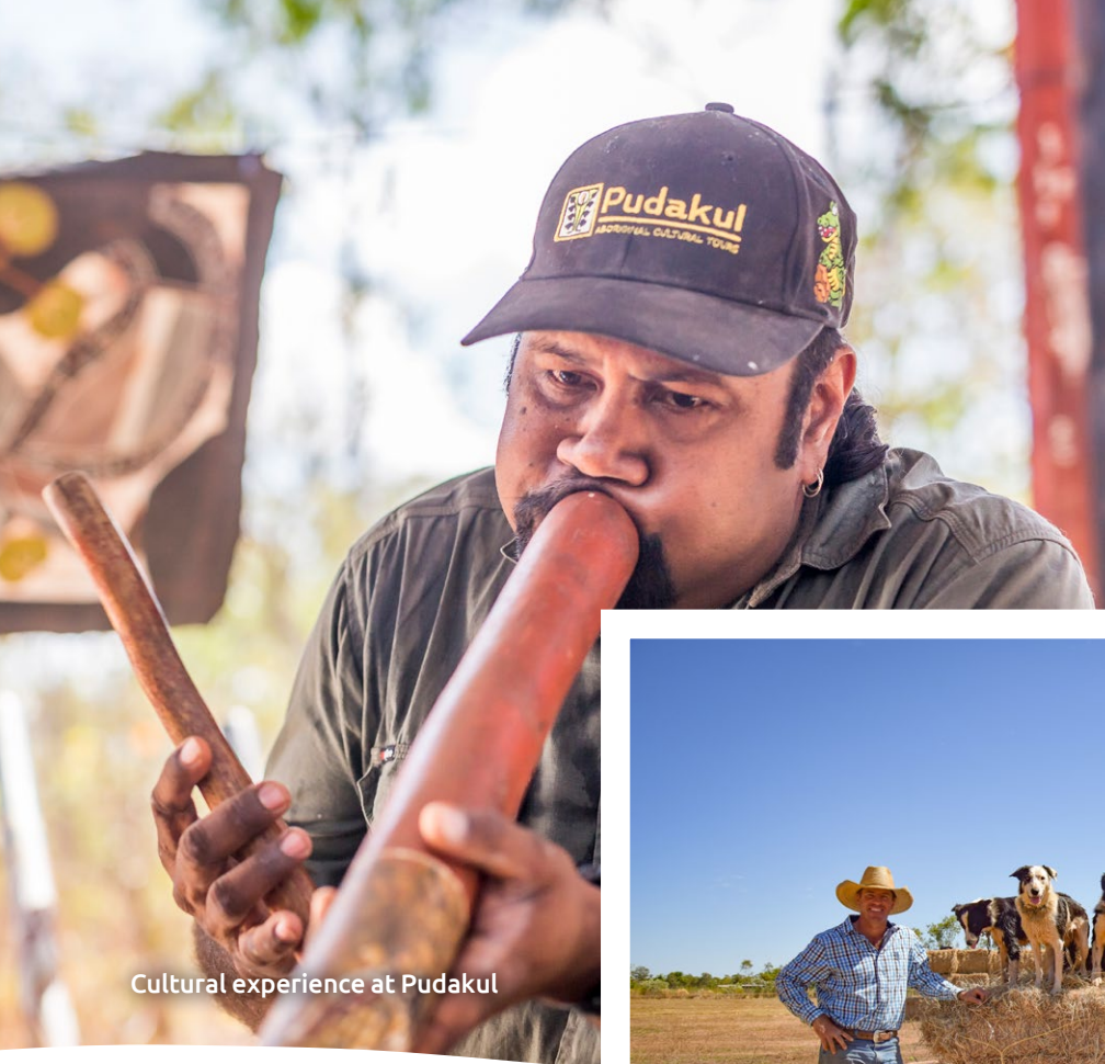
Cultural experience at Pudakul