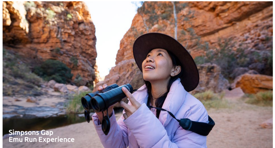
Simpsons Gap Emu Run Experience

A hands-on paper-making workshop using native grasses, a surreal salt lake and magnificent views of Mt Connor make Curtin Springs a learning destination not to be missed.