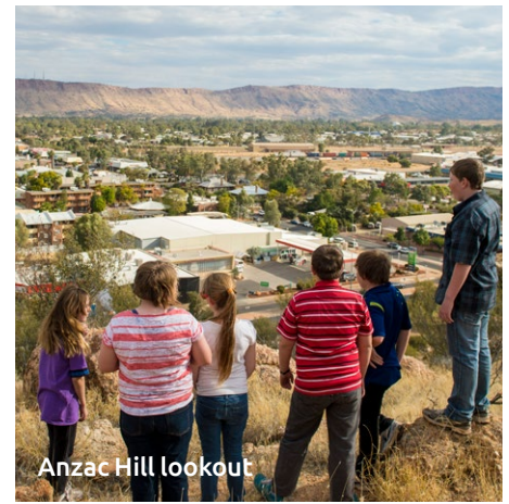
Anzac Hill lookout