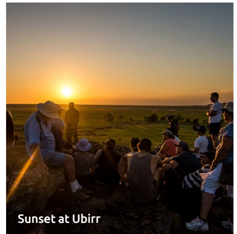
Sunset at Ubirr