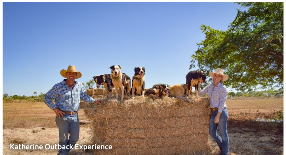
Katherine Outback Experience

Complete the final 400km drive to Alice Springs, where you'll stay for the next two nights. Drive up ANZAC Hill this evening for stunning views of the town and the MacDonnell Ranges.