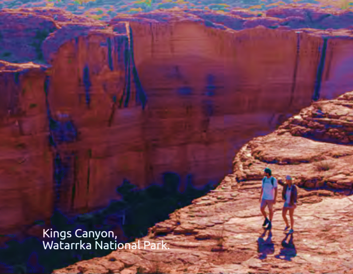
Kings Canyon, Watarrka National Park.