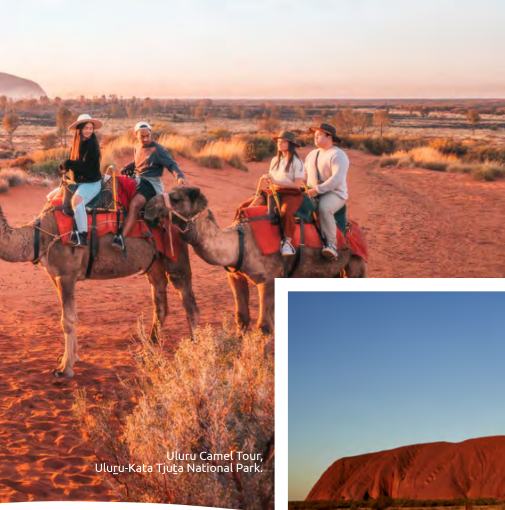
Uluru Camel Tour, Uluru-Kata Tjuṯa National Park.