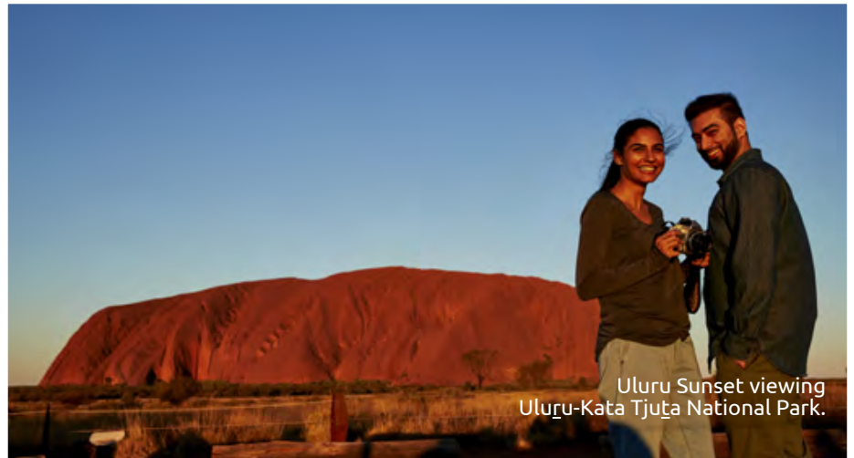
Uluru Sunset viewing Uluru-Kata Tjuṯa National Park.