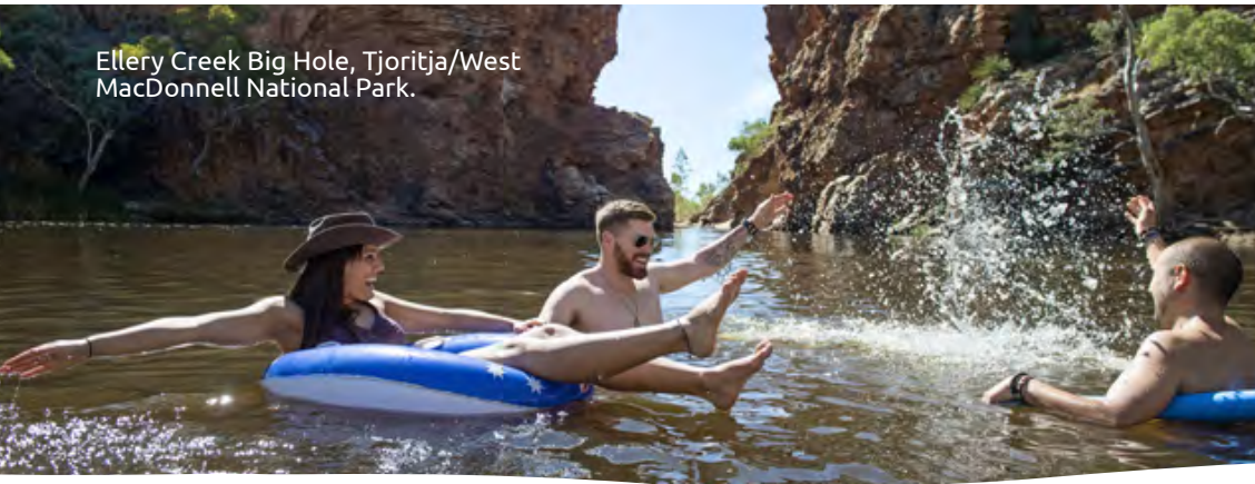
Ellery Creek Big Hole, Tjoritja/West MacDonnell National Park.