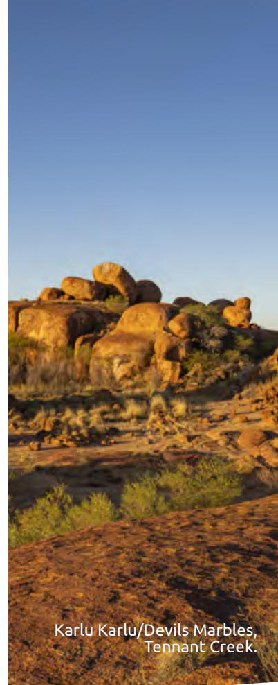
Karlu Karlu/Devils Marbles, Tennant Creek.