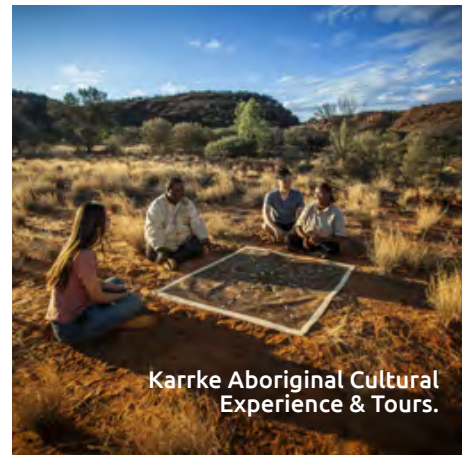
Karrke Aboriginal Cultural Experience & Tours.