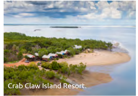
Crab Claw Island Resort.