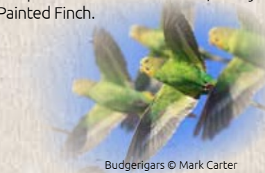
Budgerigars