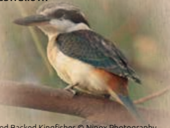
Red Backed Kingfisher