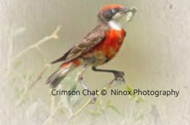
Crimson Chat