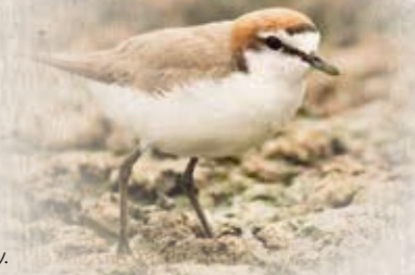
Red-capped Plover

*Access to this site is conditional. All visitors must contact Tourism Central Australia for a list of accredited guides who can facilitate entry. Costs may apply.