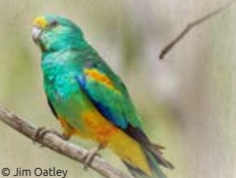
Mulga Parrot © Jim Oatley