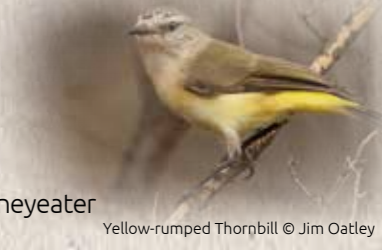
Yellow-rumped Thornbill