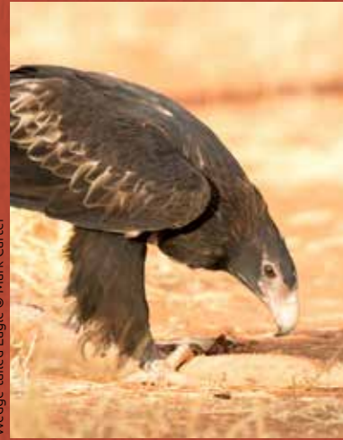
Wedge-tailed Eagle

Alice Springs and its surrounding area is a fantastic birding destination. The desert landscape of Central Australia is home to 180 bird species in a range of spectacular habitats from sandstone