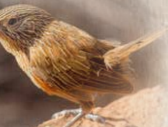
Dusky Grasswren