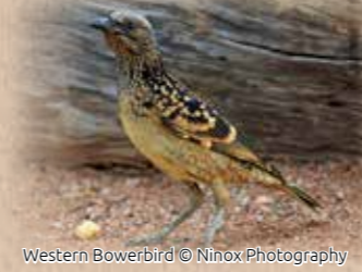
Western Bowerbird