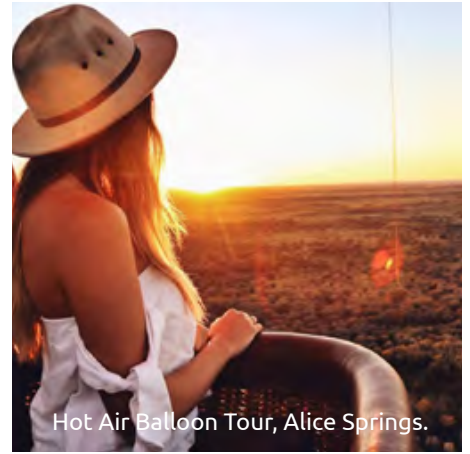
Hot Air Balloon Tour, Alice Springs.