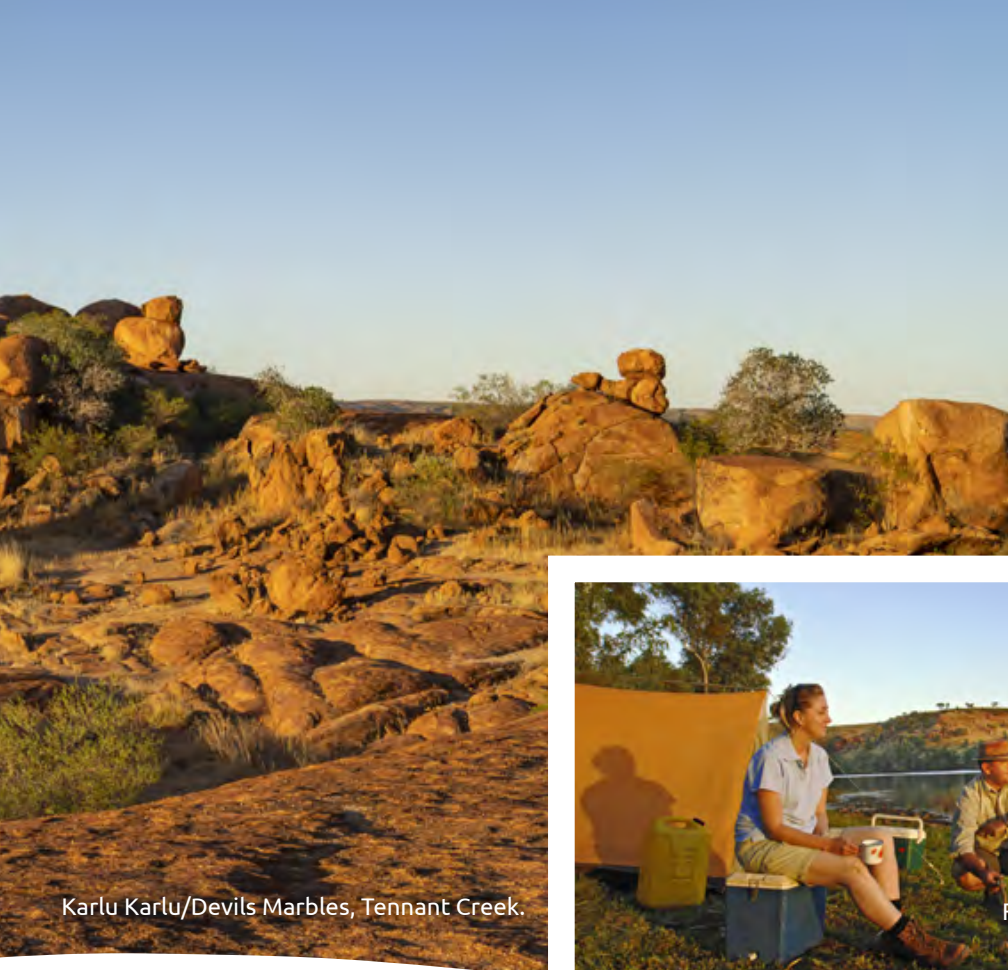
Karlu Karlu/Devils Marbles, Tennant Creek.