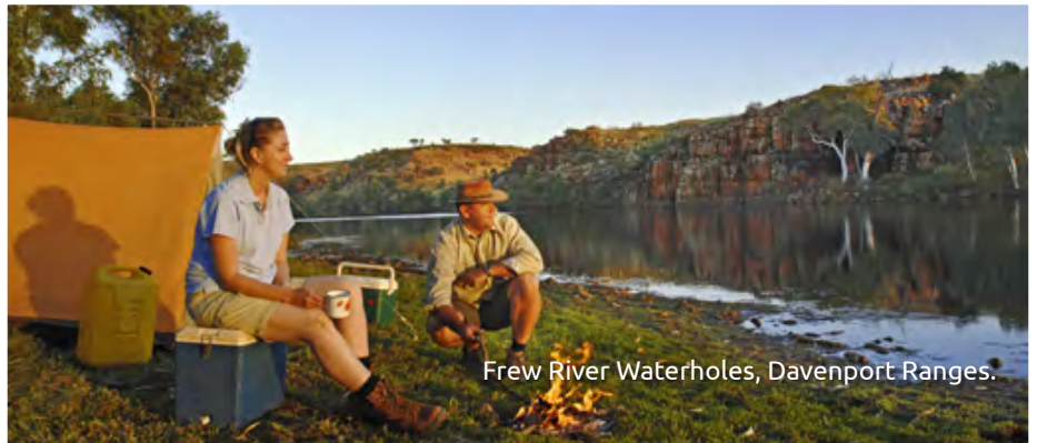
Frew River Waterholes, Davenport Ranges.

powered or unpowered caravan and camping site, or in a cabin. Try your luck fossicking for semi-precious stones such as zircons and red garnets.