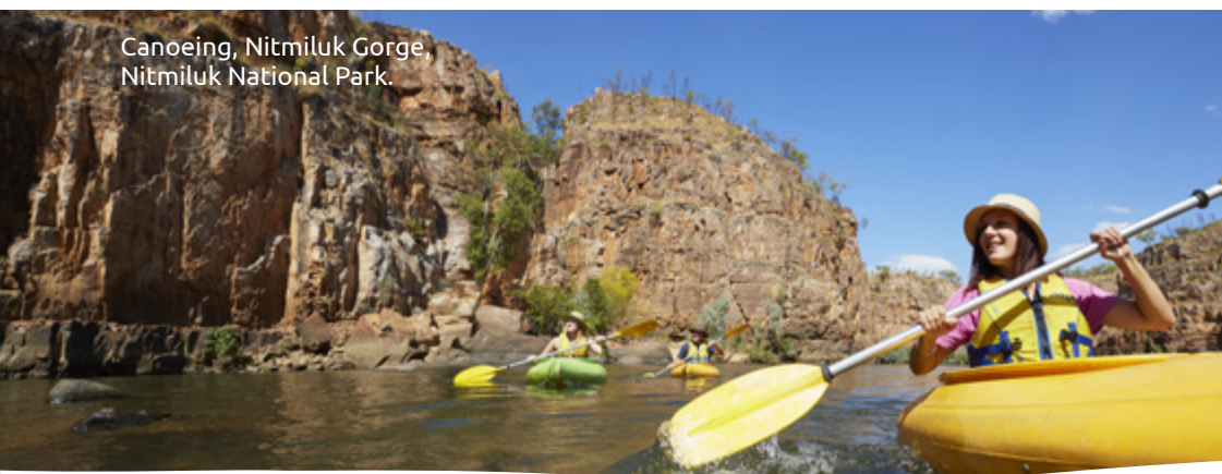
Canoeing, Nitmiluk Gorge, Nitmiluk National Park.