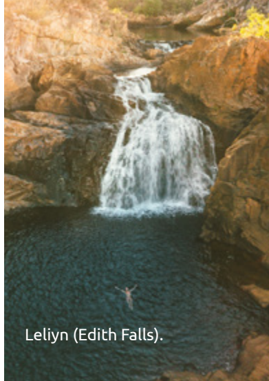
Leliyn (Edith Falls).