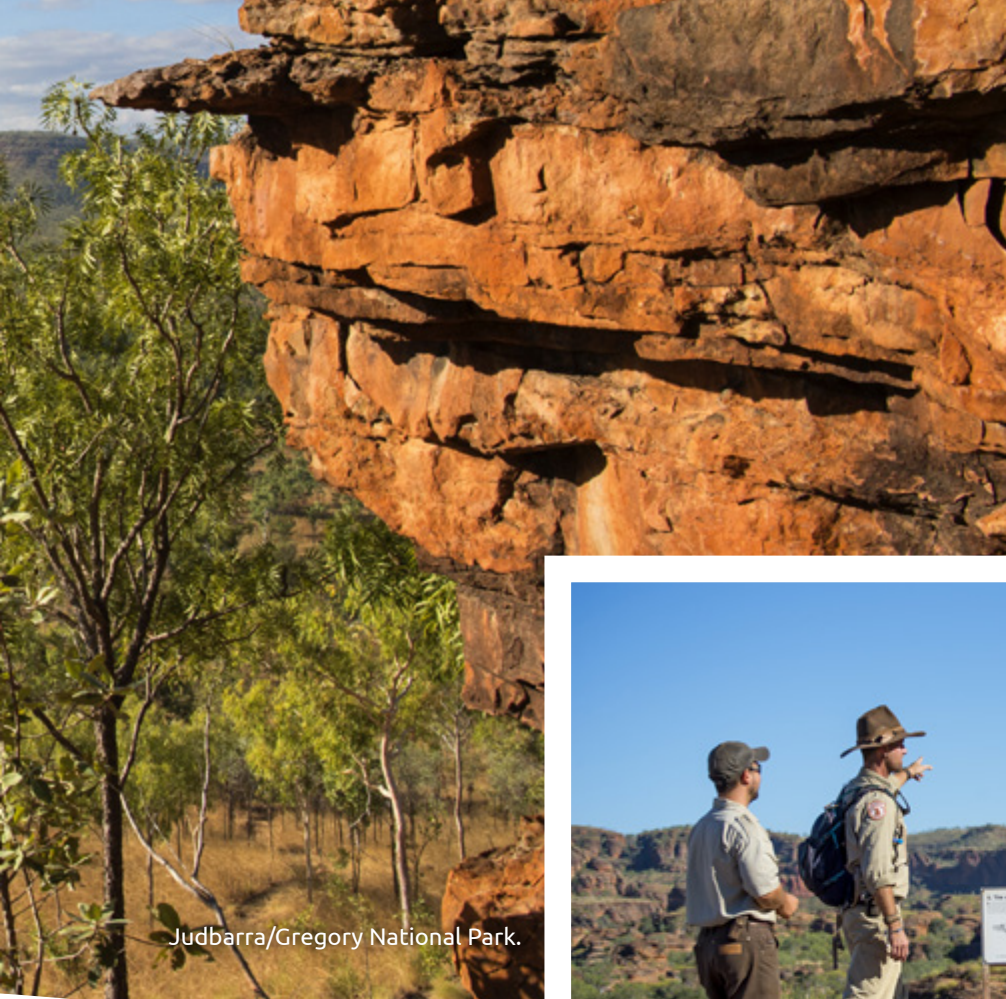
Judbarra/Gregory National Park.