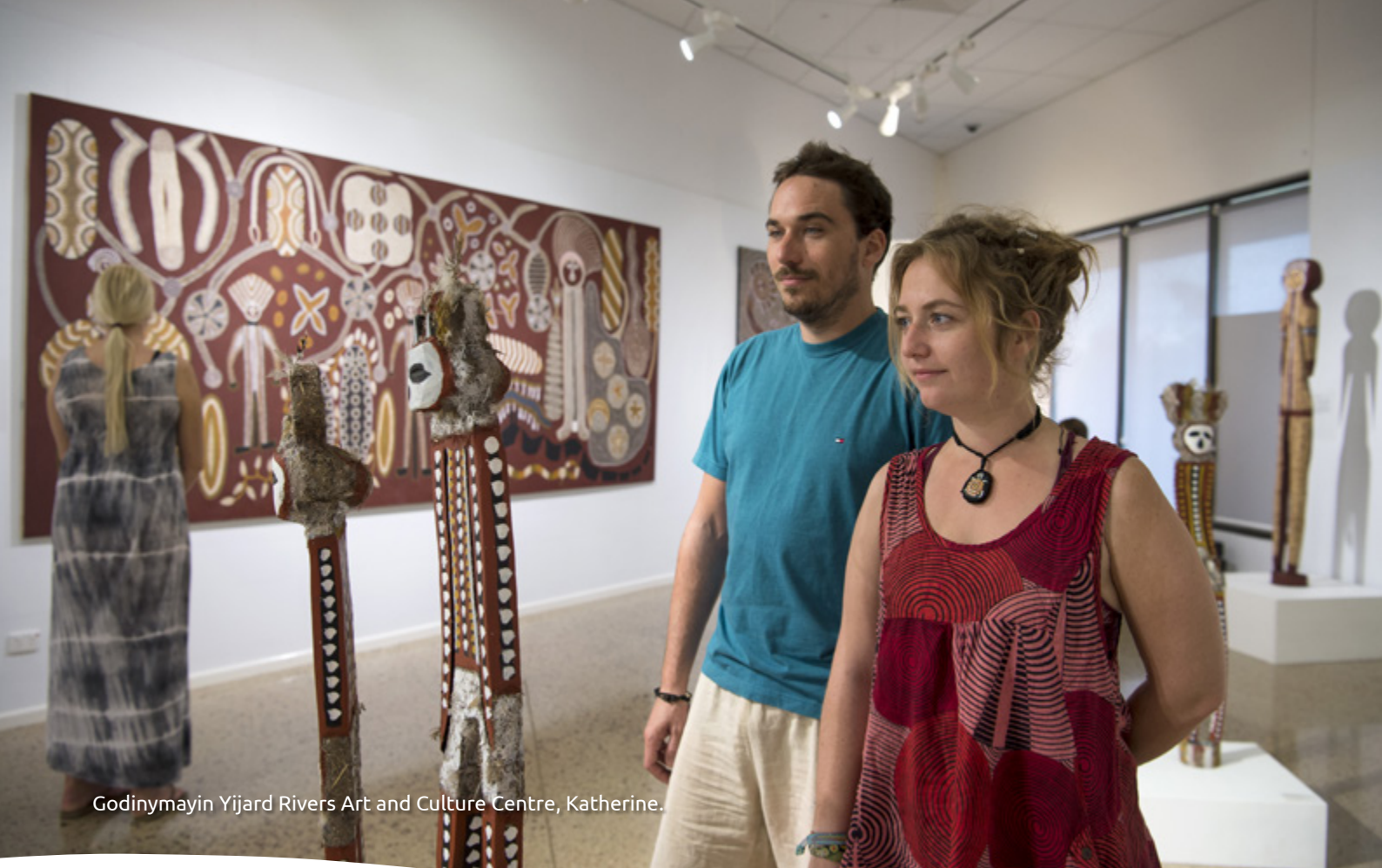
Godinymayin Yijard Rivers Art and Culture Centre, Katherine.

heritage site. Drive to Nackerloo Lookout for breathtaking views of the area. If fishing is your thing – this is the perfect place to throw in a line. Remember to Be Crocwise.