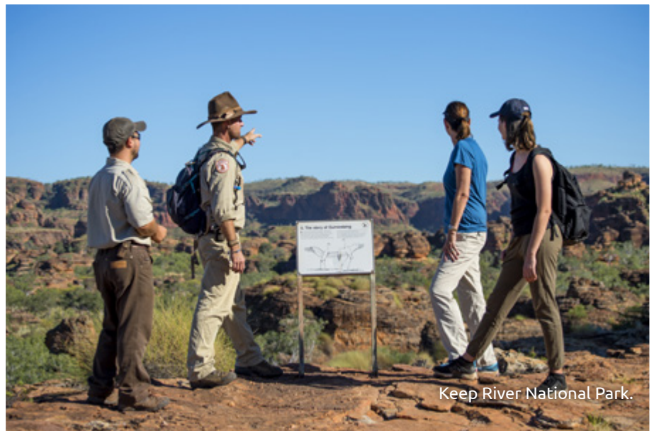
Keep River National Park.

is specially tagged and worth $1million dollars for the lucky angler. Season is from 1 Oct - 31 Mar.