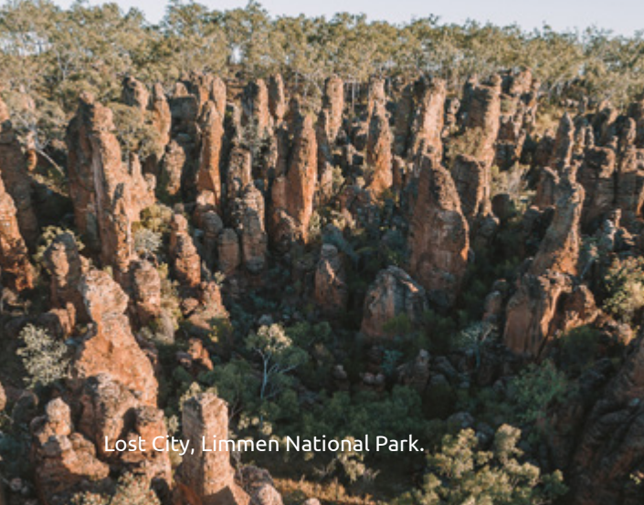
Lost City, Limmen National Park.