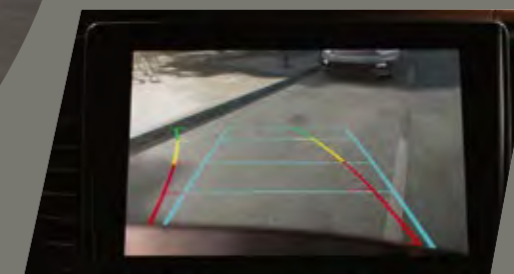
Rear Camera with Dynamic Guideline