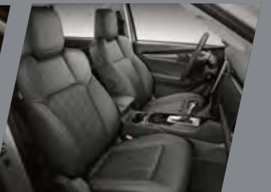
Luxury Black Leather Seats