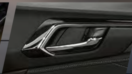
Walk Away Auto Lock