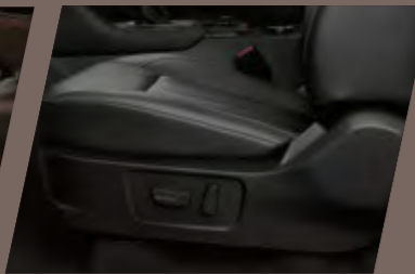
Electrically Adjustable Seat