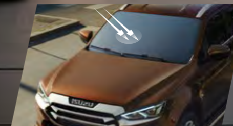
IR Cut Windshield