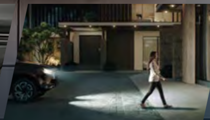
Follow Me Home