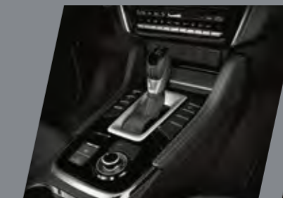
Electronic Parking Brake, Auto Brake Hold