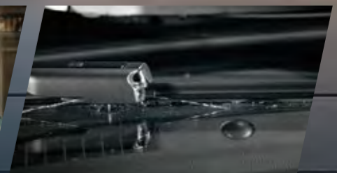
Rain Sensing Wiper