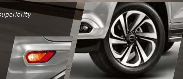
Rear Fog Lamp