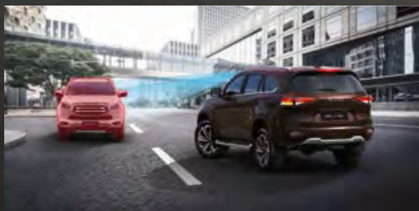
• Turn Assist