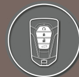
REMOTE ENGINE START